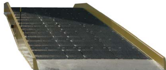
Special 118" wide, 30,000 lb. ramp featured above.

8 Foot Level-Off —gives the fork truck the level entry necessary in most loading and unloading conditions.