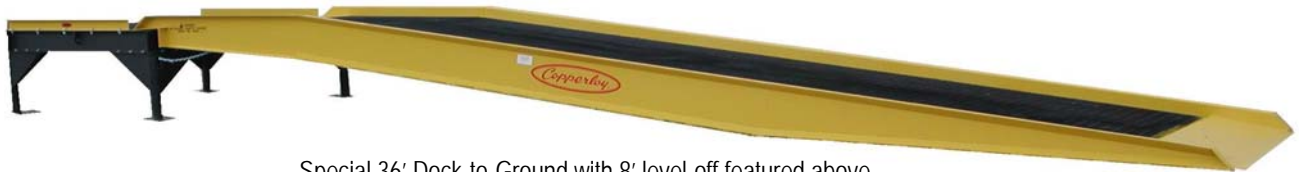
Special 36' Dock-to-Ground with 8' level-off featured above.

Dock-to-Ground Ramps are used in situations where vehicles need to travel from grade level to dock height. Retrofittable to almost any existing dock. Used in applications where mobility is not a necessity. Open faced steel grating allows snow, water, and other debris to fall through leaving a high traction running surface. Dock-to-Ground Ramps offer a more versatile and competitive alternative to permanent concrete installations.